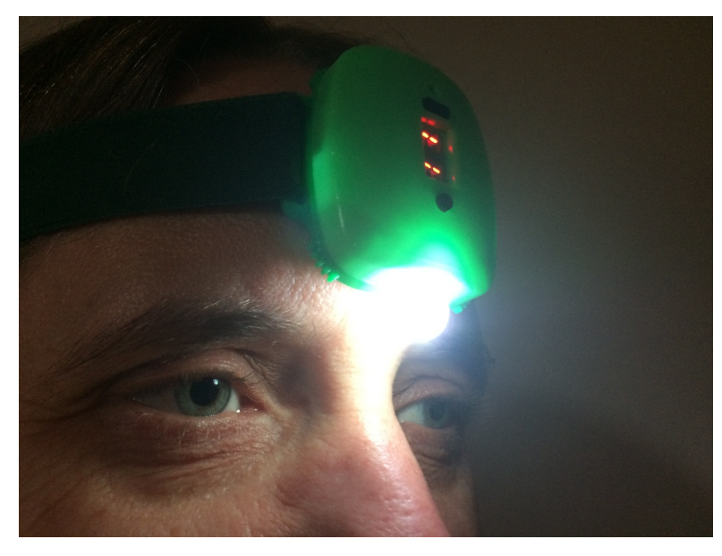
Figure 3. White light for luminotherapy.

SLEAPI sleeping light emission awaking provider instrument [12] [13] [14] [15] can stay on the forehead throughout the night or be placed beside the sleeper without disturbing the partner.